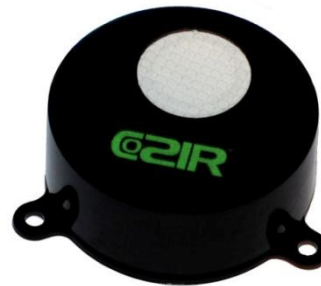
COZIR™ Ambient Sensor